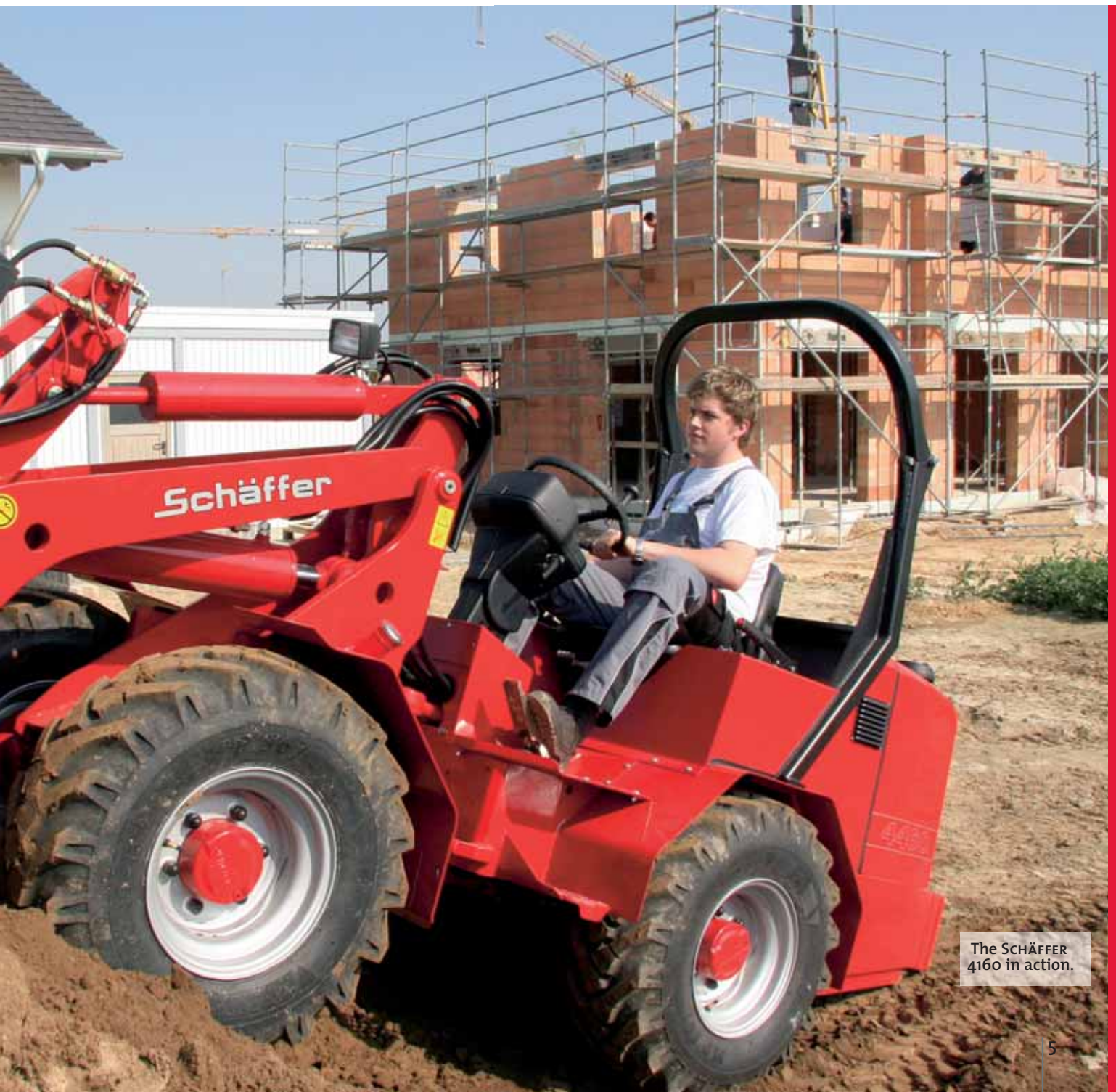
The SCHÄFFER 4160 in action.