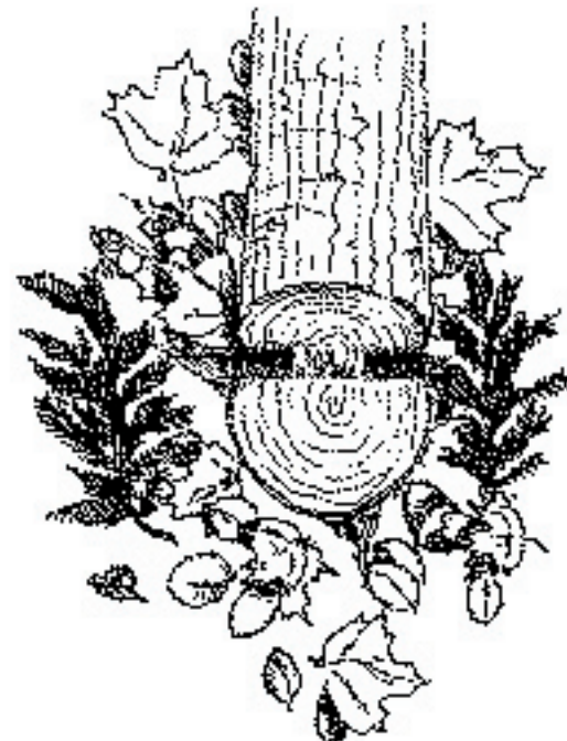
Fig. 2: The FISH Cut creates a tapered strap of wood that is pulled from the stump, releasing tension and preventing splitting. Because it extends into the stump, it holds the tree in place as it falls, keeping it from rolling or kicking back.

OPERATION: The FISH Cut, which is used with an open-face notch, is essentially a variation on a technique already in use. Many loggers will weaken the hinge on high-grade trees to prevent splitting. From the front side of the tree, facing the notch, they bore the tip of the saw into the apex of the notch (that is, the meeting point of the top and bottom cut) through the middle of the hinge, holding the saw level with the angle of the back cut. This practice weakens the hinge, allowing it to break when the tension might otherwise cause the tree to split. The only