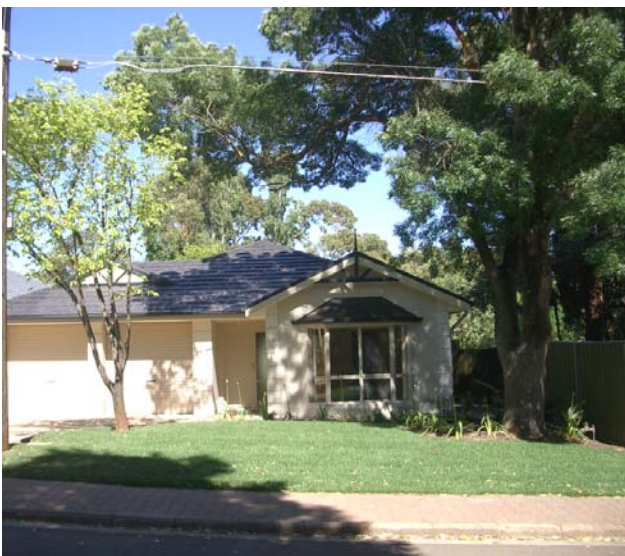
Well established trees can add appeal to a development, as well as provide valuable shade from the hot summer sun

This information leaflet will provide a guide to implementing a tree protection zone. This is important in providing an effective preservation system where trees on or adjoining development sites are prevented from unnecessary damage to root systems.