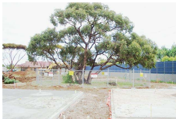
A good tree protection zone in place during construction

In order to encourage root growth and maintain future root growth, it is also wise to spread mulch (such as woodchips) to a depth of 10 cm around the base of the trunk within the Tree Protection Zone. This assists in the retention of moisture, provides organic nutrients and reduces the potential of compaction.