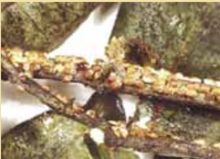
Gum-free Scale and Sooty Mould on eucalypt (CP)

Scale look like dense colonies of white or brown globules on branches, stems and leaves, and can be found on a wide range of plants. Gum-tree Scale are a serious pest of eucalypts, particularly those with blue-green foliage, such as SA Blue Gum ( Eucalyptus leucoxyton ). Severe infestations can cause malformation of terminal shoots, premature leaf drop, crown thinning, or even death. Scale produces sticky honeydew, upon which Sooty Mould, a black powdery fungus sometimes grows. Dense Sooty Mould can prevent adequate sunlight from reaching the leaves, effectively smothering the tree. Ants moving up the tree to feed on the honeydew can also be an indicator of scale infestation.