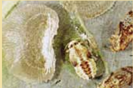
Lasiopsylla sp. lerps and psyllid nymph and adult on eucalypt leaf (CP)