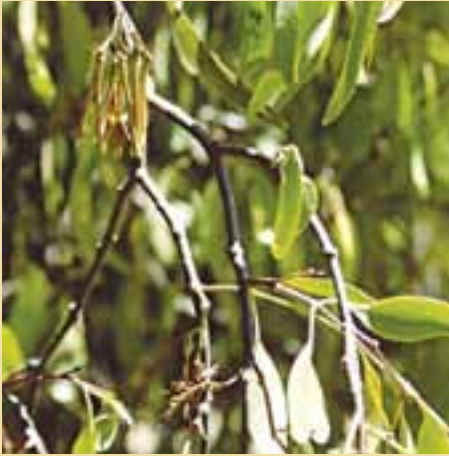
Box Mistletoe with flowers on SA Blue Gum (RP)

Dodder-laurel ( Cassytha spp.) or “snotty-gobble” are a group of native parasitic leafless plants that can, in isolated instances, become so dense that they smother the native vegetation on which they grow. They have slender twining, yellow to green threadlike stems. Seed germinates near the soil surface in spring and summer. The twining seedling coils itself around a host plant and produces small structures called haustoria that penetrate the host's vascular tissue and extract nutrients and water. Once established on a host plant, the soil root dies. Dodder-laurel can spread to surrounding hosts, creating a tangled mat of stems over affected plants. Severe infestations weaken host plants and reduce their capacity to recover from insect attack, disease and other stresses.