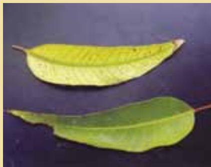
Diseased leaf (top) and healthy leaf (bottom) (JR)