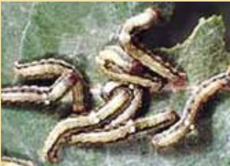
Mature Autumn Gum Moth ( Mnesampela sp.) caterpillars (CP)