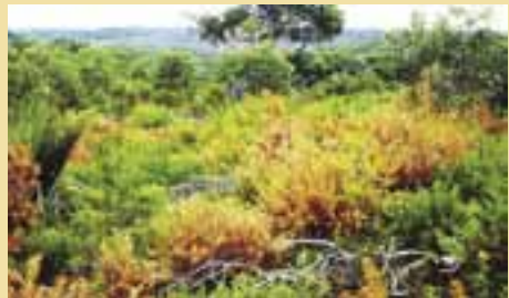
Phytophthora killing Banksia (RV)