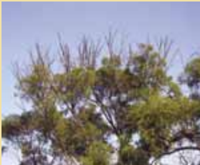
Stage 1 - crown thinning (NW)