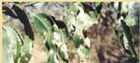
Crinkle leaf disease (CP)