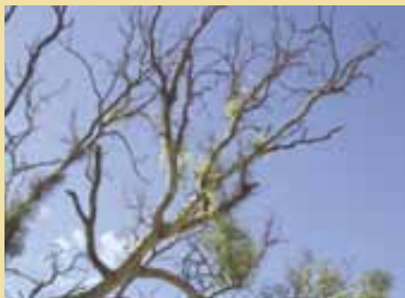
Mundulla Yellows (JR)

Leaf yellowing can also be caused by a number of other factors including herbicide poisoning, lack of available soil moisture (see page 13), Phytophthora (see page 17) and nutrient deficiencies alone, such as Iron, Manganese, Magnesium, Copper, Zinc or Potassium.