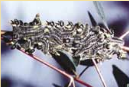
Sawfly larvae ( Perga sp. - spiffires) (SC)

Insect damage is one of the more easily observed factors in dieback. Insects can affect plants in many different ways. They can damage vegetation when consuming it as food or using it as shelter. Plants can normally cope with this damage, however survival may be threatened if it is excessive. Most insects that damage native vegetation are native species themselves, and are a necessary and important part of the ecosystem. They only become a problem when the natural population control factors are altered. Insects can be divided into general groups relating to the damage they cause, as leaf defoliators, leaf skeletonisers, sap suckers, borers or gall formers