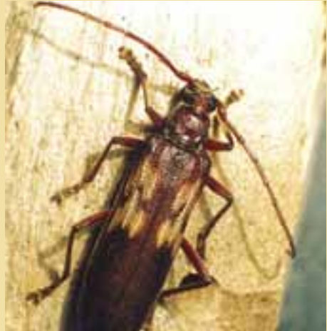
Adult longicorn beetle ( Phoracantha sp.) (RP)