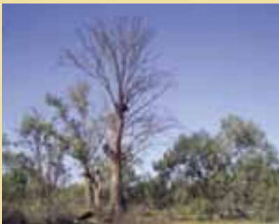
Stage 3 - tree death (NW)