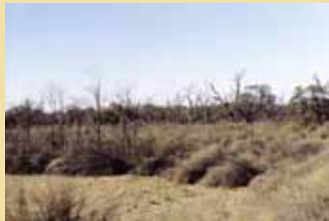
River Red Gums and Ligum are dying and salt-tolerant saltbushes and samphires dominate the ground layer. (RP)