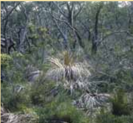
Phytophthora killing Xanthorrhoea (BH)

There are several leaf diseases caused by fungi, such as "corky leaf spot", "crinkle leaf disease", and "angular leaf spot". Generally, these leaf diseases do little long-term damage.