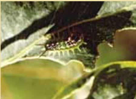
Cup Moth ( Doratifera sp.) larva (RP)