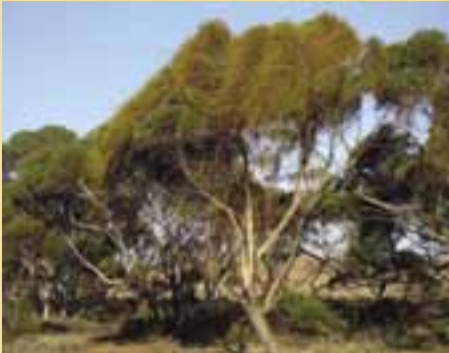
Dodder-laurel on Mallee (NW)