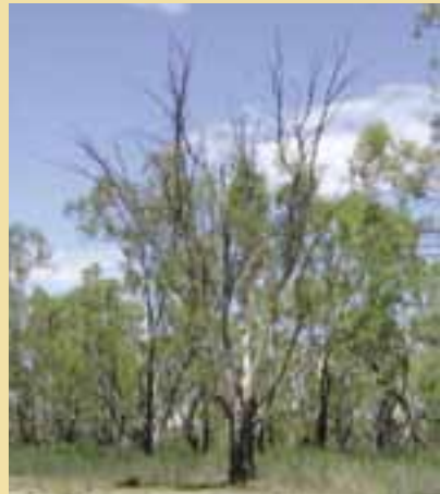
Stage 2 - epicormic regrowth (NW)