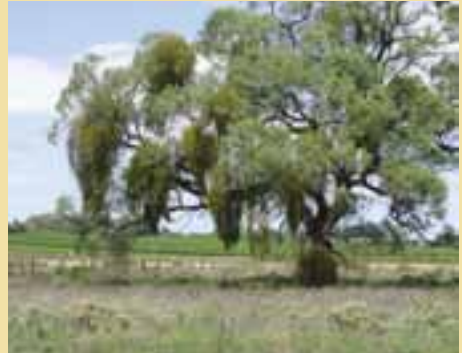
Box Mistletoe on River Box (RP)

Introduced dodder ( Cuscuta spp.) can look similar to Dodder-laurel, and is a potentially significant agricultural issue that should be reported and controlled. For information on recognising and controlling dodder, contact an authorised Animal and Plant Control Officer through the SAMDB Natural Resource Management Board.