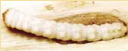
Bulls Eye Borer ( Phoracantha acanthocera ) larva (CP)

Galls are formed in response to insects laying their eggs inside plant tissues, in response to larvae feeding or by fungi and bacteria. The plant responds by producing an enlarged growth or "gall" around it. These galls can be small pimples on the leaves, spherical woody balls, woody enlarged stems or large lumps on leaves.