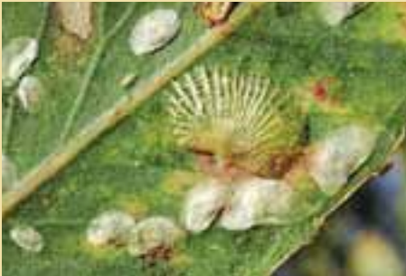
Cardiaspina sp. and Lasiopsylla sp. lerps on eucalypt leaf (OR)

Sap suckers are insects that feed by sucking the nutritious sap from leaves and stems. The damage they cause may be subtle with little initial obvious external evidence. However, damage usually becomes more evident as population numbers build up. If dying leaves do not appear to be chewed, then it is likely that sap-sucking insects, such as aphids, psyllids (lerp insects) or scale are present. Psyllids protect themselves by building a waxy covering (lerp) under which they feed and reproduce and are safe from predators and insecticides. Psyllids are generally most active during summer. Outbreaks of lerp insects on River Red Gum seem to occur when there is a succession of dry summers and wet winters.