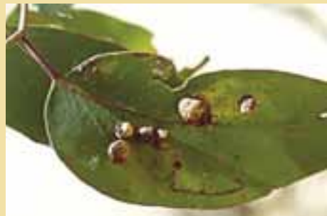
Typical gall on eucalypt leaf (RP)