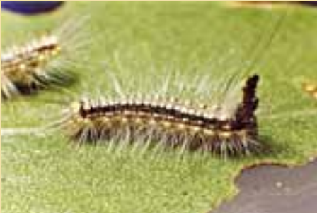
Gum-leaf Skeletoniser larva ( Uraba sp.) (CP)

The caterpillar of the Gum-leaf Skeletoniser attacks a range of eucalypts. Infestations on River Red Gums occur when the absence of flooding coincides with the larval stage. This allows insects to mature and lay eggs. Inadequate environmental flows in the rivers and creeks of the SAMDB no longer provide suitable conditions for the natural controls of the Gum-leaf Skeletoniser and their numbers will increase. Trees generally recover, but sustained attacks, or increased stresses from other factors, such as lack of available soil moisture or fire can ultimately cause tree death.