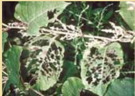
Chrysomelid Beetle larvae damage (JB)

Leaf defoliators (or grazers) chew off pieces of leaves and eat them. Damage may appear as tiny or large holes, or as irregular shaped leaves with jagged edges. Defoliators account for a large part of the conspicuous damage to trees. Examples include caterpillars (larvae) of Cup Moths, Bag Moths, Emperor Gum Moths, Sawfly larvae and larvae and adults of Eucalypt Leaf Beetles (Chrysomelid beetles), Christmas and other Scarab Beetles and Eucalypt Weevils. Sometimes whole leaves are eaten and only the midrib remains.