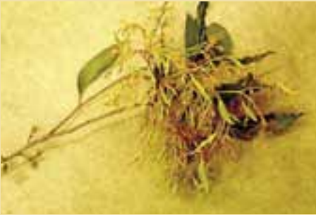
Witches' broom on eucalypt branch tip (RV)

Witches' broom is a symptom in woody plants where many twigs are densely clustered together, resulting in a mass of abnormal terminal shoots that resemble a broom. Leaves are often small and deformed with yellow margins. This growth of abnormal shoots can be caused by various microorganisms or insects, including Chrysomelid beetles, and by nutrient deficiencies. Witches' broom may give the tree an odd appearance, but won't kill it, unless other stress factors are present. Witches' broom may be confused with mistletoe. Obvious differences are that mistletoe has green leaves, fleshy fruit and flowers, and is usually part way along a branch. Witches' broom is usually found at the growing tips on the ends of branches and does not have flowers or fruit.