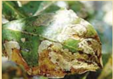
Leaf Blister Sawfly ( Phylacteophaga sp.) damage (RP)

Larvae of Leaf Blister Sawfly, a type of leaf skeletoniser, produce distinctive transparent, brown "blisters" on leaves, caused by the larvae feeding just below the leaf surface. Leaf miners also produce similar symptoms, leaving a thin "skin" over their feeding lines as they move just below the surface of the leaf.