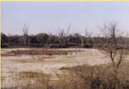
Salt scalding on the floodplain (RP)

In 2003, a Murray Darling Basin Commission report noted that, "flooding under current conditions now appears insufficient to provide the supply of water that is necessary for survival of River Red Gums in this arid area", referring to the floodplains of the lower River Murray. Large numbers of trees are exhibiting signs of severe stress and some are dying. This is of considerable concern as the health of these trees is a reflection of the ability of the floodplain to regenerate. Without either natural or artificial floods, the trees will die and the landscape will change forever. As part of an interim management response to ease stress levels in River Red Gums on the Chowilla floodplain, artificial floods have been generated through a combination of gravity supply and pumping at 14 sites on the floodplain. The response has been very positive, with River Red Gums recovering well at all sites. Prior to flooding at Werta Wert Wetland, 93% of the trees around the wetland were classified as "stressed". Since flooding, 90% of those stressed trees have developed new leaves and are now classified as "healthy". There has also been a proliferation of Red Gum seedlings at Coppermine Waterhole and Woolshed Creek sites. The long-term survival of these seedlings will depend on regular flooding and careful grazing management.