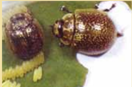
Chrysomelid ( Paropsis sp.) Beetles with eggs (CP)