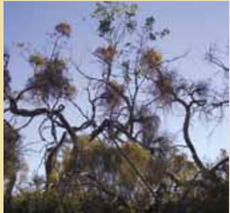
Dead mistletoe on dead eucalypt (NW)