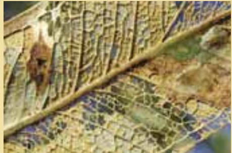
Leaf Skeletoniser damage (OR)