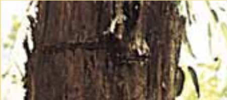
Borer damage affects bark growth (RP)

Borers are insects that make holes in the hard tissues in the wood, roots or bark as they feed. This damage is sometimes in dead wood, more often in live trees, and generally due to feeding by the larvae of Longicorn, Scarab and Jewel Beetles and Cossid Wood Moths. Lifting the bark may expose the channels and tunnels of borer species that feed just below the bark. Other species feed on the inner sapwood and heartwood, and their presence is usually not apparent until the adults emerge and holes are found in the tree trunks. By this time the damage has already been done.