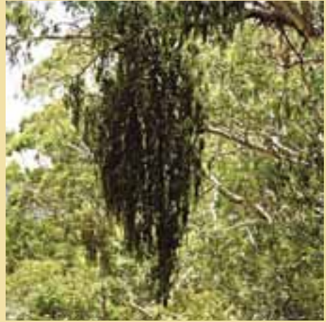
Box Mistletoe on SA Blue Gum (RP)