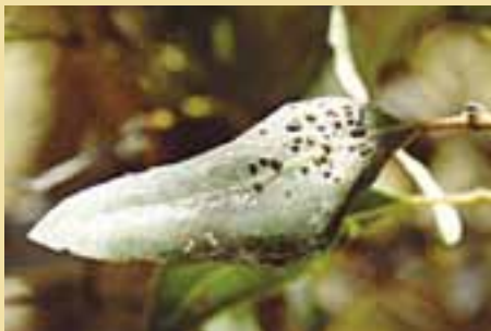
Wasp galls on eucalypt leaf (RP)

Galls are formed in response to insects laying their eggs inside plant tissues, in response to larvae feeding or by fungi and bacteria. The plant responds by producing an enlarged growth or "gall" around it. These galls can be small pimples on the leaves, spherical woody balls, woody enlarged stems or large lumps on leaves.