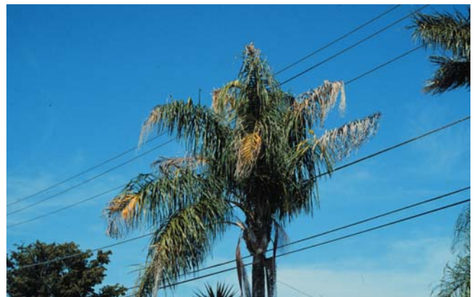
Figure 25. Powerline decline in Syagrus romanzoffiana .