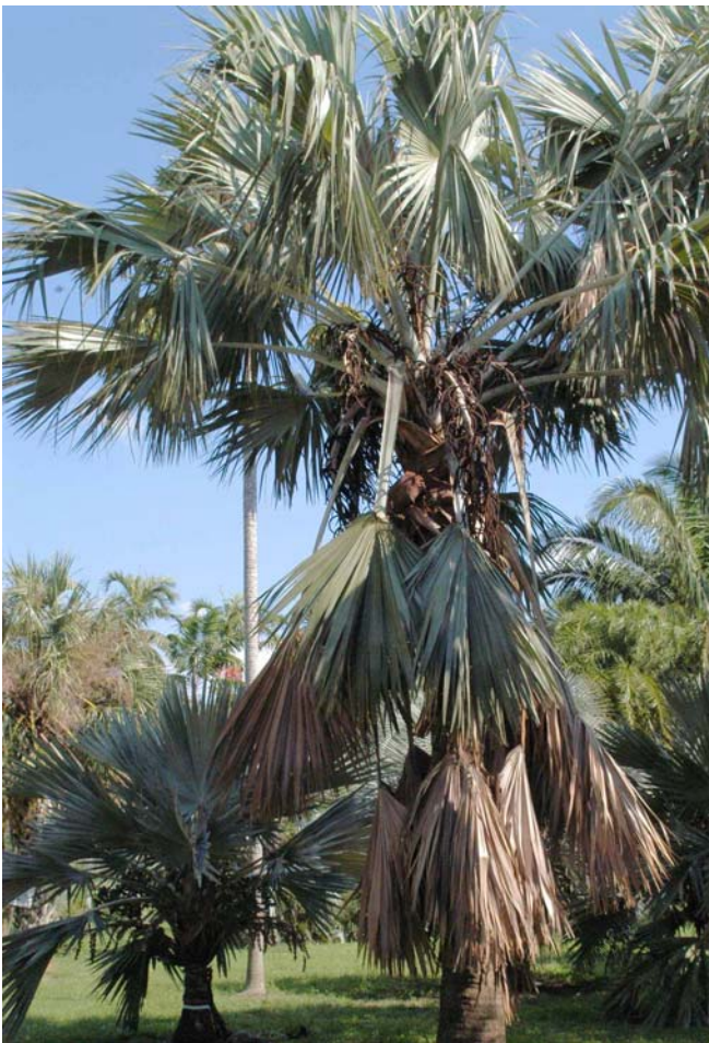
Figure 30. Broken petioles on Bismarckia nobilis caused by high winds. Credits: T.K. Broschat