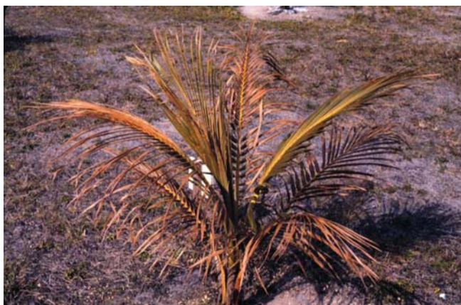
Figure 3. Freeze damage on Cocos nucifera .

Exposure to temperatures below that to which palms are acclimated will cause injury. Palms differ greatly with respect to their cold tolerance, both within and among species. Within a species, susceptibility to cold injury is reduced by gradually acclimating palms to cooler temperatures. Temperatures of 50°F or lower can injure some tropical palms (Figure 4), while some temperate species can withstand freezing temperatures with no