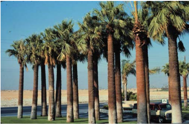
Figure 18. Washingtonia filifera planted at varying depths to achieve a uniform height. Note that at least one palm is dying from deep planting.

arrested development at the base of the trunk due to desiccation. Shallowly planted palms are structurally unsound and can easily topple over in moderate to high winds (Figure 19).