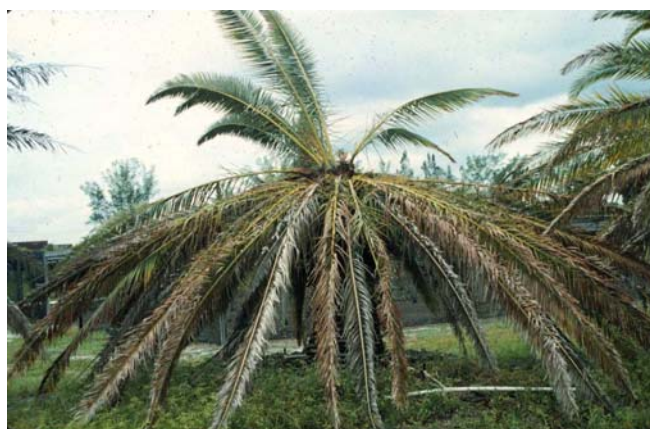
Figure 21. Lightning damage on Phoenix canariensis .