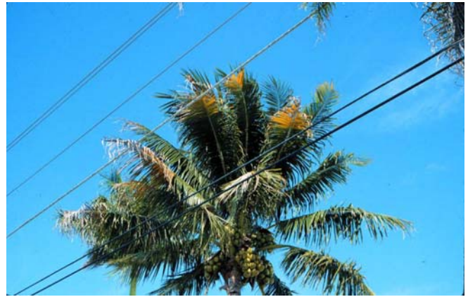
Figure 23. Powerline decline of Cocos nucifera . Note chlorotic leaf tips.

Electromagnetic fields within 2 to 5 feet of a high voltage power line appear to cause injury to palm foliage. Leaves do not need to physically contact the wires for injury to occur and often occurs on the side of the palm opposite the wires as well as those nearest to the lines.