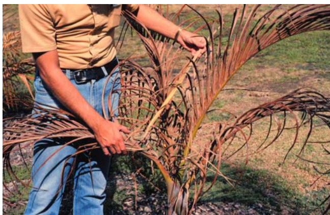
Figure 5. Secondary bud rot on Hyophorbe verschafeltii following severe freeze.