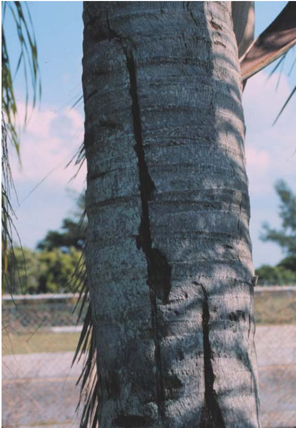
Figure 7. Vertical trunk splitting in Syagrus romanzoffiana caused by excessive water uptake.