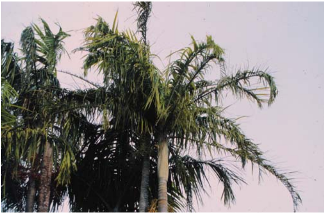
Figure 29. Wind damage on Carpentaria acuminata showing tattered leaflets.