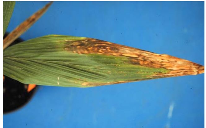
Figure 15. Older leaf of Syagrus romanzoffiana seedling suffering from high soil soluble salts.

Palms suffering from high soil soluble salts usually have necrotic leaflet tips on older leaves (Figure 15). New foliage may express typical Fe deficiency symptoms or wilting due to reduced root surface area for nutrient and water absorption (Figure 16). Roots will often have necrotic tips or more extensive necrosis due to secondary root rots.