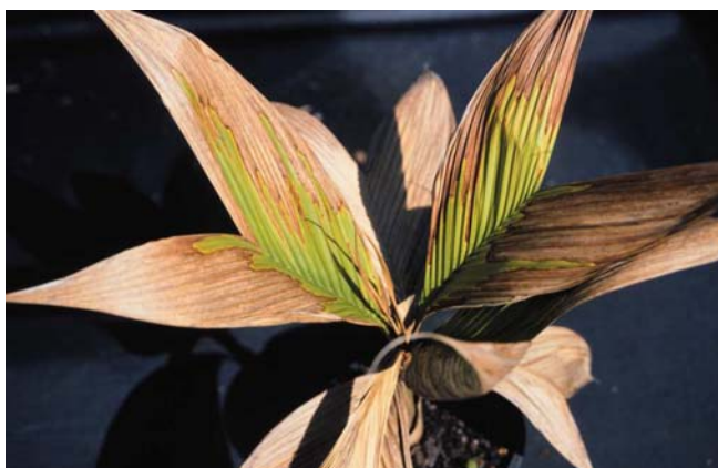
Figure 4. Chilling injury on Geonoma sp. caused by temperatures below 10°C.

injury. Palms stressed by cold temperatures are very susceptible to bacterial bud rot (Figure 5) and may later show signs of micronutrient deficiencies, such as Mn, due to lower root activity at cooler temperatures (Figure 6).