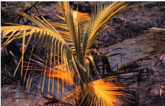
Figure 26. Poorly aerated soil causing root suffocation in Cocos nucifera .

Early symptoms of root suffocation are often those of Fe deficiency, with chlorotic new leaves being produced (Figure 26). In severe cases, wilting of the foliage and shrinkage of the trunk may occur (see Figure 17). Roots may appear rotted. The root rot diseases that often result are secondary problems.