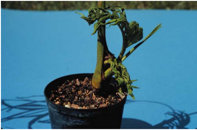
Figure 14. Preemergent herbicide (metolachlor) injury on Dypsis lutescens . Note the production of side shoots.

some environmental factors affecting the activity of these materials that are not understood at this time.