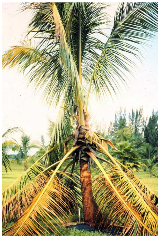
Figure 20. Rapid collapse of Cocos nucifera caused by lightning.

Visual symptoms are usually sufficient for diagnosis. No other disorder can cause a perfectly healthy palm to collapse and die within a couple of days.