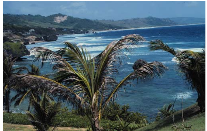
Figure 8. Foliar salt injury on Cocos nucifera caused by airborne salt spray.

Foliar salt injury appears as desiccation of the foliage. Symptoms may be more severe on the exposed windward side of palms growing near the ocean (Figure 8). Some palms may be killed by salt spray.