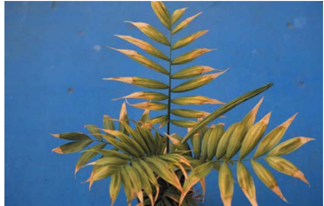
Figure 1. Boron toxicity of Chamaedorea elegans .

Boron toxicity is rare in areas that have high rainfall, but can occur in drier climates (e.g., central California). It can occur anywhere if excessive B fertilizers are applied or if high B water is used for irrigation. Boron toxicity has been artificially induced in Dypsis lutescens (areca palm) and