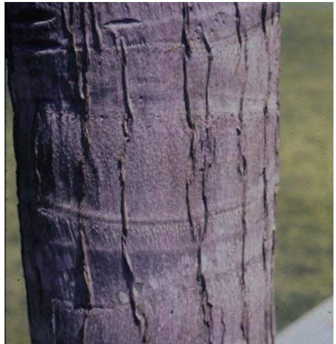
Figure 17. Shriveled trunk of Syagrus romanzoffiana caused by deep planting.

Palms planted too deeply usually exhibit symptoms of root suffocation such as chlorosis from Fe or Mn deficiency, wilting or shriveling of the trunk, reduced canopy size, root rots, and ultimately death (Figures 17 and 18). Palms stressed from deep planting are also more attractive to boring insects such as Dinapetes wrightii in California or Rhynchophorus spp. or Metamasius spp. in more humid tropical areas.