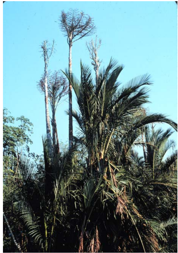
Figure 10. Hapaxanthic flowering in Metroxylon sagu .

Hapaxanthic flowering occurs in Caryota spp., Arenga spp., Corypha spp., Wallichia spp., Nannorhops ritchiana , some Metroxylon spp., and Raphia spp.