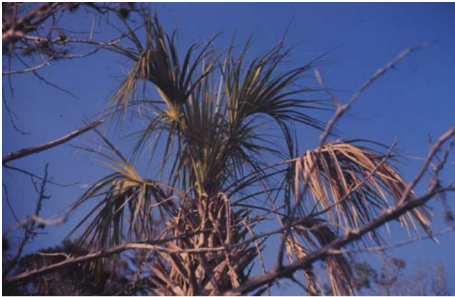
Figure 16. Salt injury on Sabal palmetto growing in area subject to salt water inundation.