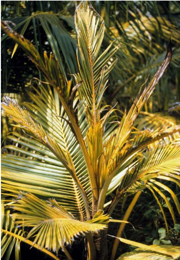
Figure 6. Micronutrient deficiency symptoms (probably B and/or Mn deficiencies) induced by cold temperatures in Cocos nucifera .

Damage caused by hard freezes will affect all parts of a palm and all susceptible palms within an area, whereas damage caused by a frost will likely be spotty in distribution and may affect only exposed parts of individual palms.