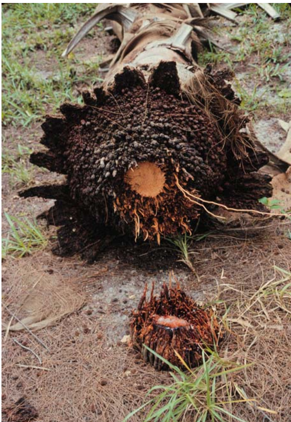
Figure 19. Cocos nucifera transplanted too shallowly.

arrested development at the base of the trunk due to desiccation. Shallowly planted palms are structurally unsound and can easily topple over in moderate to high winds (Figure 19).