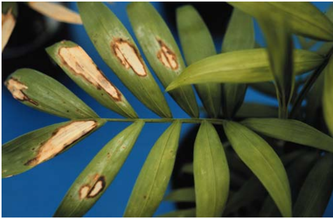
Figure 27. Sunburn injury on Chamaedorea elegans .