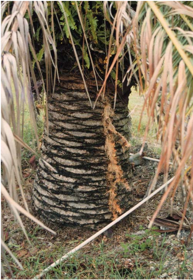
Figure 22. Trunk of Phoenix canariensis struck by lightning.