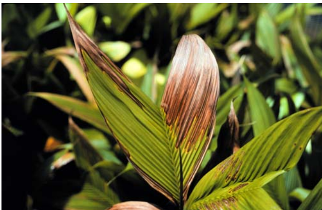
Figure 28. Water stress on Geonoma sp.

Typical water stress symptoms include reduced growth and necrosis of leaflet tips, spreading to the entire leaf as severity increases (Figure 28). Oldest leaves are usually the first to show symptoms, but eventually newly emerging leaves may also wither and die. Death of the meristem or bud may follow. Water stress in some species is indicated by leaflets folding about the midrib or wilting. In mature palms, shriveling or collapse of the trunk may also occur (See Figure 17).