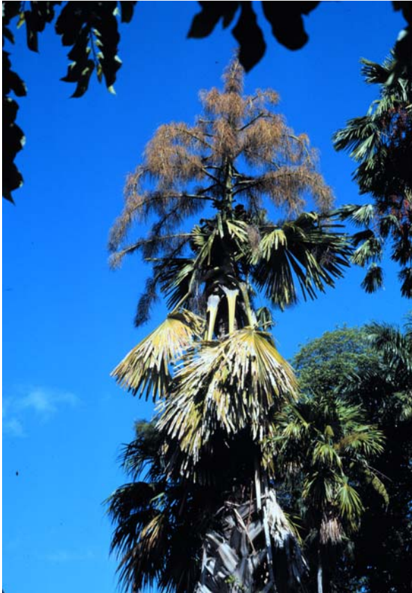
Figure 9. Hapaxanthic flowering in Corypha elata (talipot palm).

Stems of flowering and fruiting palms gradually decline and die (Figures 9 and 10). Flowering may be terminal, or along the trunk, the latter beginning either at the top or at the bottom, depending on the species.