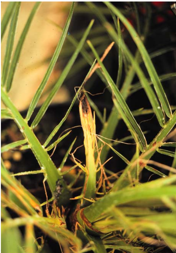
Figure 11. Glyphosate injury on Phoenix roebelenii (pygmy date palm).

Preemergent herbicides typically cause injury to newly emerging foliage. Symptoms include new leaf dieback, chlorosis, stunting, and varying patterns of necrosis (Figure 12). Death of the meristem or bud is common (Figure 13). In palms treated with metolachlor, symptoms often include the production of side shoots in addition to new leaf stunting, necrosis, and distortion (Figure 14). Large palms growing in landscapes can also be affected by preemergent herbicides, often fatally.