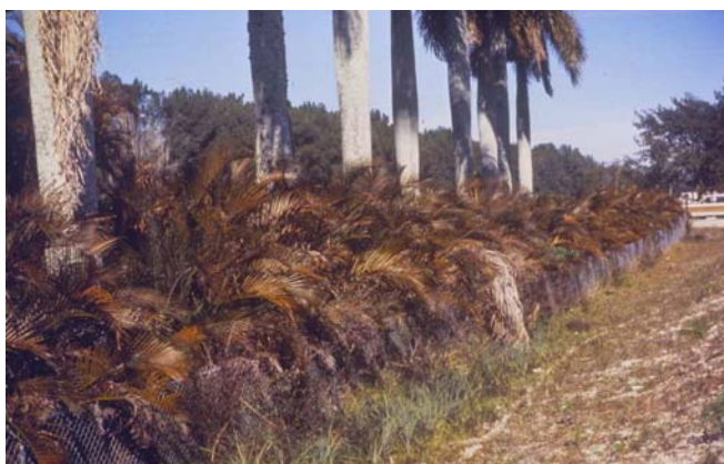
Figure 2. Freeze damage on Dypsis lutescens .

Primary symptoms include extensive necrosis of the foliage (Figures 2 and 3). Necrosis is not necessarily confined to leaflet tips. Symptoms may include those of water stress such as wilting. Unhardy palms may be killed. Secondary symptoms include bacterial bud rot (Figure 5) and transient micronutrient deficiencies (Figure 6).