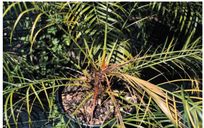
Figure 13. Preemergent herbicide (trifluralin plus isoxaben) injury on Phoenix roebelenii .

palms in the landscape that have been treated. Although some studies have shown certain preemergent products to be quite safe when used on palms at recommended rates, other studies have shown injury from these same products when applied to the same species at similar rates. Clearly there are