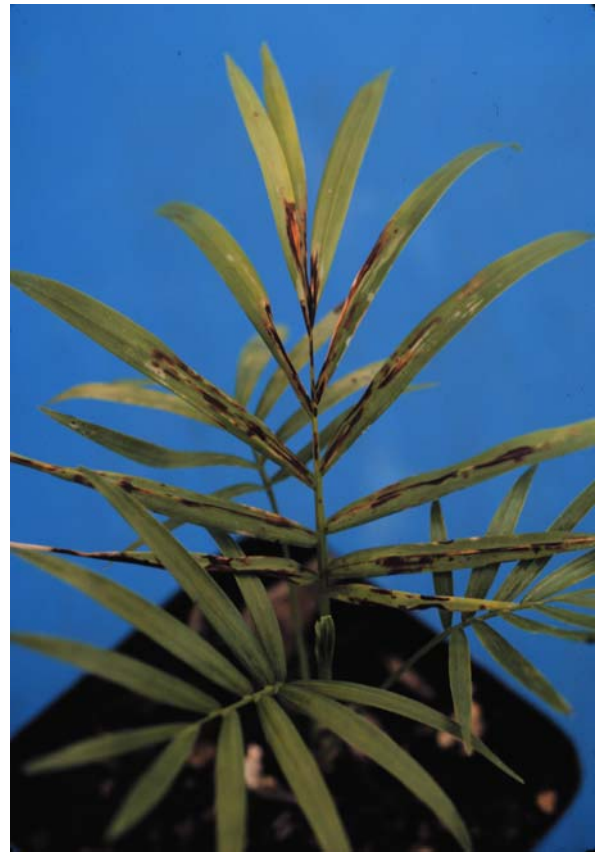
Figure 12. Preemergent herbicide (pendimethalin plus oxyfluorfen) injury on Chamaedorea elegans .

Injury due to preemergent herbicides is fairly common where these are applied to container-grown palms, but these products can also affect mature