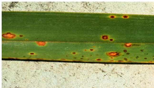
Figure 2. Leaf spots often change in color and size as the disease progresses.

Leaf spots usually appear on leaves of all ages. With juvenile palms that only have a few leaves, the leaf spots may appear on all leaves at the same time. With most leaf spot diseases, the pathogen will produce spores directly on the leaf tissue. These spores are spread by rain, overhead irrigation, wind,