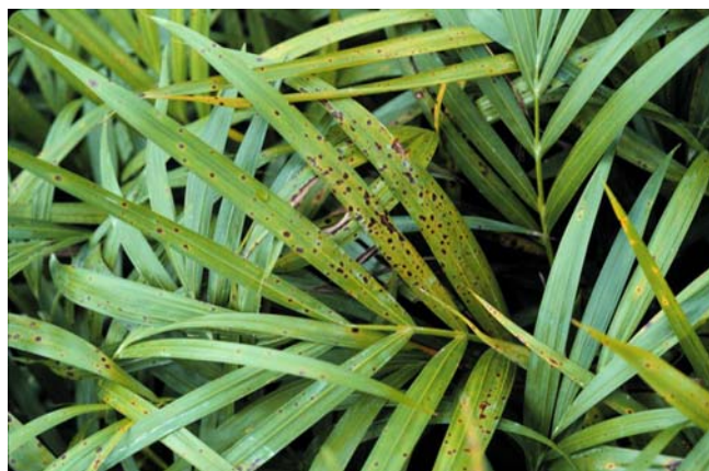
Figure 1. Leaf spots on palm leaflets. These are brown with a chlorotic (yellow) halo. Note that as spots increase in number and size that there is a merging of dead tissue (blight).

If environmental conditions are optimum for the disease, the spots can increase in number or size such that large portions of a fan palm blade or large number of leaflets of a feather palm blade are diseased. If severe enough, entire leaflets or leaves may desiccate and die as lesions expand and coalesce causing leaf blights.