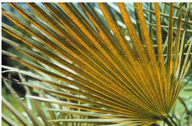
Figure 10. Potassium-deficient older leaf of Chamaerops humilis showing translucent orange and necrotic spotting.

Potassium deficiency is caused by insufficient K in the soil, but can be induced or accentuated by high N:K or Ca:K ratios in the soil. Potassium is readily