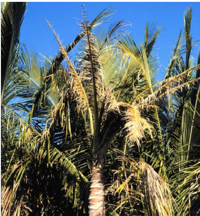
Figure 14. Late-stage K deficiency in Cocos nucifera showing small chlorotic and necrotic new leaves and trunk tapering. This palm died shortly after the photo was taken.