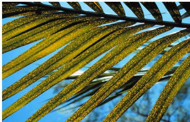
Figure 1. Older K-deficient leaf of Dictyosperma album showing translucent yellow-orange spotting when held up to the light.

In fan palms such as Livistona chinensis (Chinese fan palm), Corypha spp. (talipot palm), Washingtonia spp. (Washington palms), and Bismarckia nobilis (Bismarck palm), necrosis is not marginal, but is confined largely to tips of the leaflets (Figures 4 and 5). In Phoenix roebelenii (pygmy date palm), the distal parts of the oldest leaves are typically orange with leaflet tips becoming necrotic (Figure 6). The rachis and petiole of the leaves usually remains green, however, and the orange and green are not sharply delimited as with magnesium (Mg) deficiency. This pattern of discoloration holds