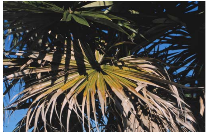
Figure 5. Potassium-deficient older leaf of Livistona chinensis showing leaf discoloration.

necrotic spotting within the leaflets (Figures 7 and 8). In most other palms, including Cocos nucifera (coconut palm), Elaeis guineensis (African oil palm), Dypsis lutescens (areca palm), Chamaerops humilis