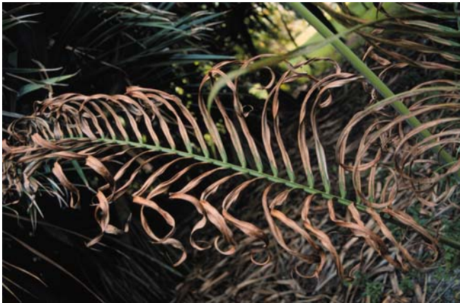
Figure 2. Potassium-deficient older leaf of Dypsis cabadae showing necrosis and curling of leaflet tips.