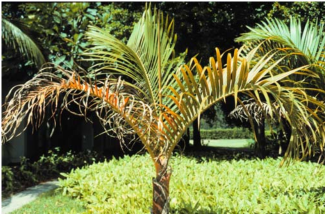
Figure 13. Potassium-deficient Hyophorbe verschafeltii showing the increase in severity of symptoms from new to old leaves.