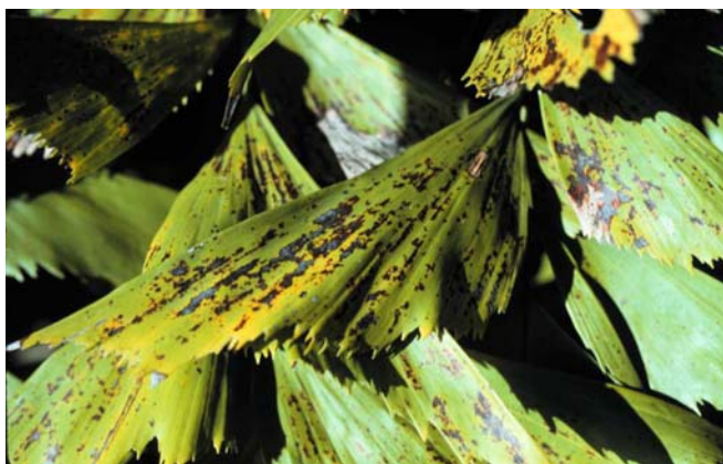
Figure 8. Potassium-deficient older leaf of Caryota mitis .