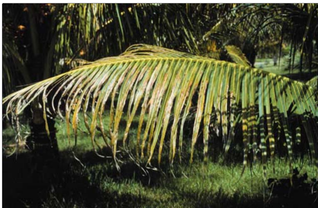
Figure 12. Potassium-deficient older leaf of Cocos nucifera showing progression of symptoms from the base to the tip of the leaf.

leached from sand or limestone soils which have very low cation exchange capacities.