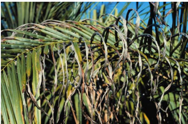
Figure 3. Potassium-deficient older leaf of Roystonea regia showing leaflet tip necrosis and curling.