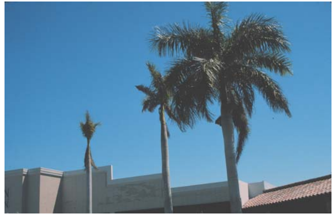
Figure 15. Late stage K deficiency in Roystonea regia showing small necrotic leaves and tapering trunk (pencil-pointing)

Potassium deficiency is very common on palms grown in highly leached sandy soils. It is less common in container substrates. Potassium deficiency is perhaps the most widespread of all palm nutrient deficiencies, occurring in most palm-growing regions of the world. It is quite severe in southern Florida and much of the Caribbean region. Although most species of palms are susceptible to some degree,