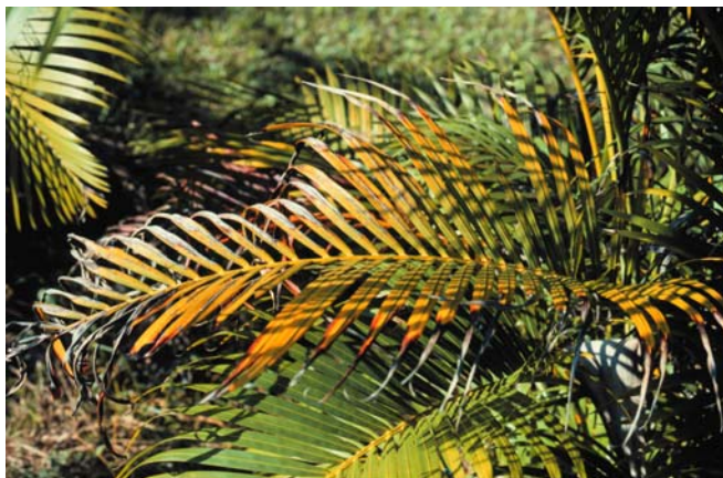
Figure 9. Potassium-deficient older leaf of Dypsis lutescens showing leaf discoloration and extensive necrosis of the leaflet margins and tips.