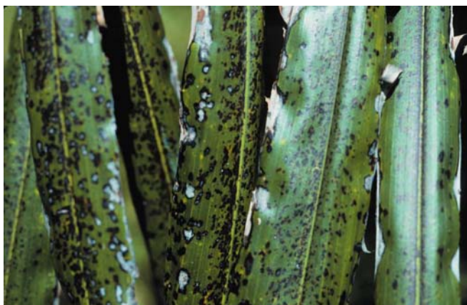
Figure 7. Potassium-deficient older leaf of Arenga sp.