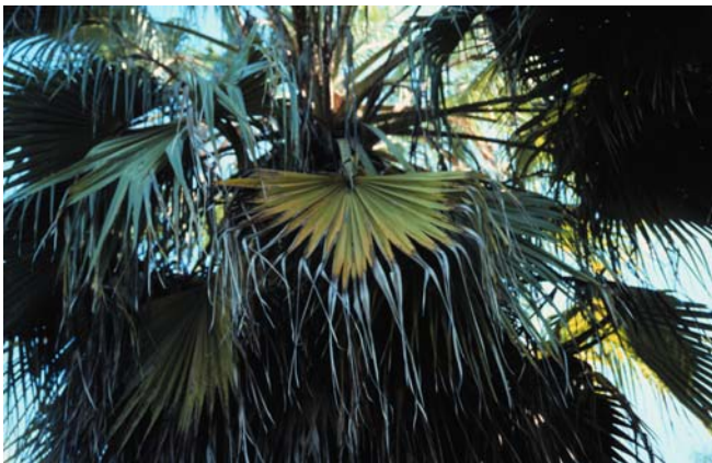
Figure 4. Potassium-deficient older leaf of Washingtonia robusta showing extensive leaflet tip necrosis.

necrotic spotting within the leaflets (Figures 7 and 8). In most other palms, including Cocos nucifera (coconut palm), Elaeis guineensis (African oil palm), Dypsis lutescens (areca palm), Chamaerops humilis