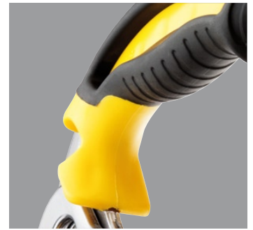
The dual-density molding provides a wide supporting surface at the bottom and excellent grip.