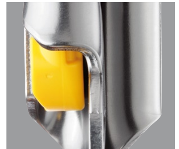
The specific planed catches limit the risk of snagging.

Petzl deepens the product line designed for arborists with the ASCENTREE double-handed rope clamp.